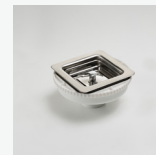
AC175Q Basket Waste