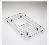
ACPSQ6 Bowl Protector