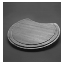
AC50 Timber Preparation Board