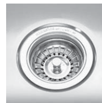
AC09 Basket Waste x 1