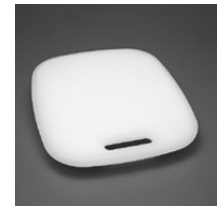
AC21 Synthetic Preparation Board