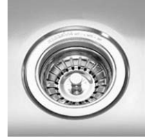
AC09 Basket Waste x 1