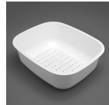
AC02 3/4 Bowl Colander