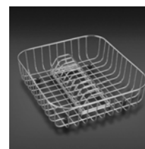
AC61 Stainless Steel Drainer Basket