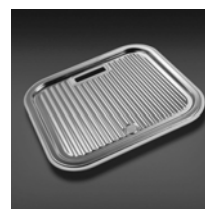
AC63 Stainless Steel Tray