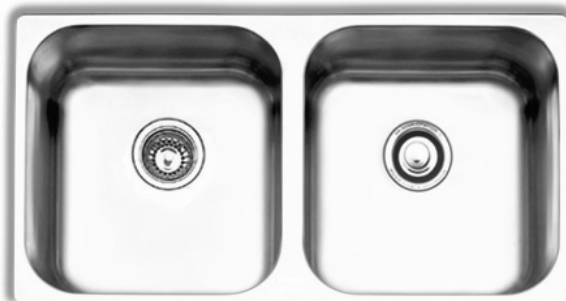
Shown with garbage disposal (not included)