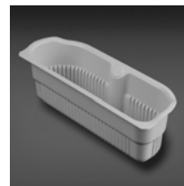
AC62 "D" Colander