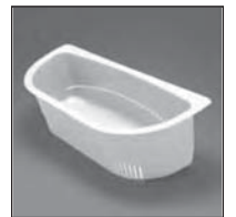
AC72W "D" Colander