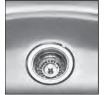
AC09 Basket Waste x1