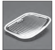
AC73 Stainless Utility Tray