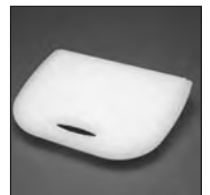
AC24 Synthetic Preparation Board

Maxi Basin 1 13 3/4 x 16 1/2 x 8" deep 6.2 Gallon Capacity