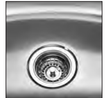
AC09 Basket Waste x1