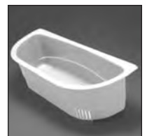
AC72W 'D' Colander