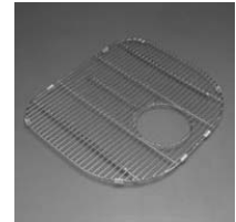
AC75 Basin Protector